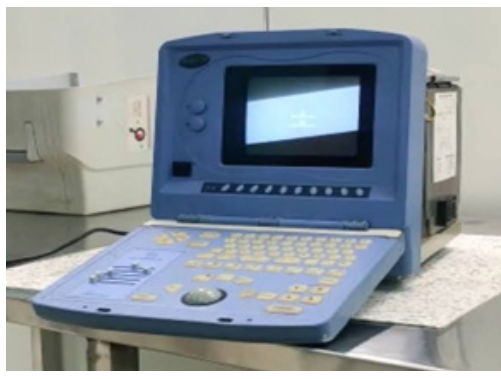
Figure 4: Portable Ultrasound System

Portable ultrasound devices have been on the market for a while, numerous studies have been conducted to determine their utility. Due to their compact size, portability, and ability to be operated both remotely and on a tabletop, these devices are easily transported. There are several portable ultrasound devices on the market such as, GE Ultrasound, Siemens Ultrasound, Sonosite Micromax and many more.