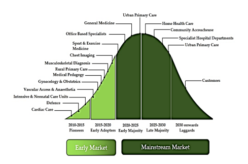
Figure 5: Graphical representation of technological advancements in ultrasound diagnosis