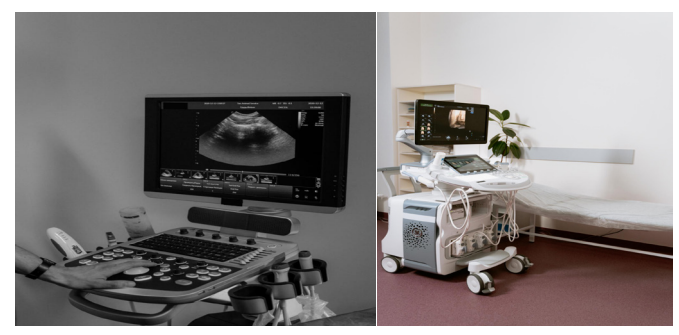
Figure 3: Standard Ultrasound Systems with multiple probes

In order to provide a better scanning experience, handheld ultrasound equipment have been continuously improved in terms of picture quality and performance. Figure 5 demonstrates the technological advancements in the use of portable ultrasonography over time in different nations.<sup>33</sup> Considering that HHU (handheld ultrasound) technologies provide affordable, secure, and reliable diagnosis and treatment