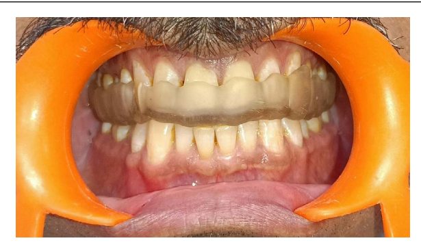
Figure 3: Occlusal splint placed intraorally

(SLM), both classified under powder bed fusion processes, find application in the production of metal dental prostheses like fixed partial dentures, implant guides, and splints.<sup>13</sup> These manufacturing techniques involve the selective sintering of a thin layer of metal powder by a laser beam, guided by 3D data. The primary distinction between SLM and SLS lies in their treatment of the powdered material: SLM fully melts the powder, whereas, in SLS the powder is partially melted or sintered.<sup>14</sup>