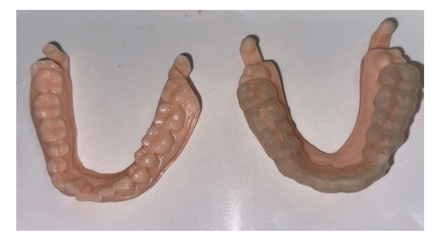
Figure 2: 3-D Printed models used for the preparation of occlusal splints

particularly in high-volume applications. 7,9