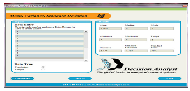
Figure 5: Mean, Variance & Standard Deviation

Mean is 3.909; Median is 6; Mode is 8; Minimum Value is 1; Maximum Value is 5; Range is 4; Variance is 3.325; Standard Deviation is 1.823; Standard Error =0.389.