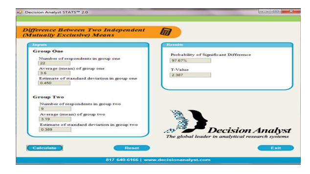
The T-score is 2.387. Probability of significant difference:97.67