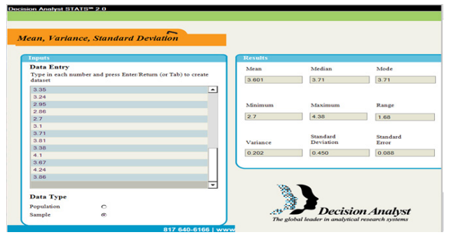
Mean is 3.601; Median is 3.71; Mode is 3.71; Minimum Value is 2.7; Maximum Value is 4.36; Range is 1.68; Variance is 0.202; Standard Deviation is 0.450; Standard Error is 0.088.

Regression Analysis is used to construct the relationship between a dependant variable (X's) and the independent variable (Y's) and one/more independent or predictor variables (X's).