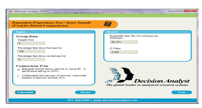
Probability of the significant Difference=99.73 The z-score is 3.000.