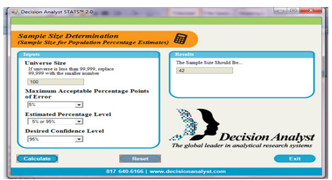
Figure 6: Mean, Variance & Standard Deviation

The Universe=100; Maximum error percentage points of Error = 5%; Estimated percentage level = 5%, Desired Confidence Level= 95% and the sample size for the same = 42.